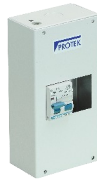
SC45RDCM (Less MCB)

Powder Coated Epoxy Resin Finish, Manufactured in the UK to BSEN 60439-3 Degree of protection IP3X to BSEN 60529 Load break & load make isolator or 30mA RCD* Cutaway sides for ease of installation Wall mountable Double pole isolation for both live and neutral Ample cabling space Incoming cable connects to isolator or RCD, outgoing from mcb and isolator or RCD Pre-punched knockouts 20mm and 25mm Keyhole slot to allow the unit to be mounted level on the wall